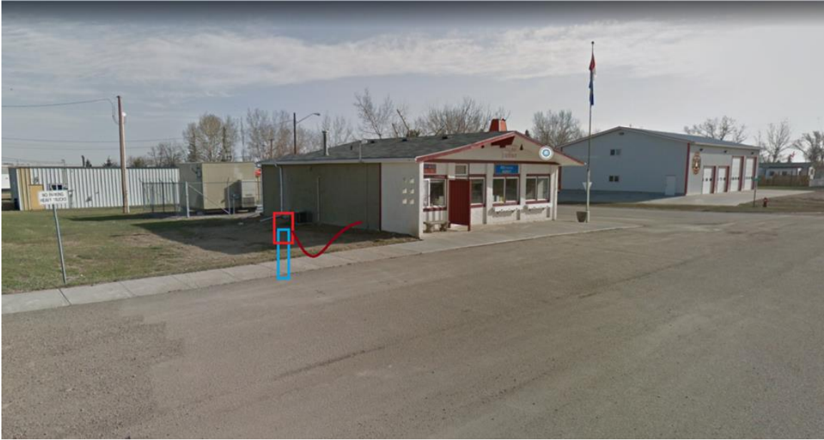
Example of intended position. The position would probably be closer to the building.