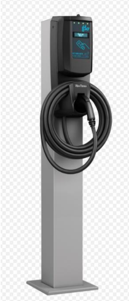
Commercial Unit at $150 / year